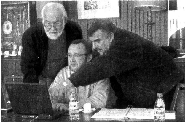
Figure 2: From the workshop at Lisbon in November 2004.

The development of questions is carried out by small, specialist teams. These teams are small groups or pairs of specialists on a particular STCW-95 subject from different organisations. The author of the question is the primary producer, then one of his colleagues in another organisation has the main responsibility of controlling the quality of the question. He can be called the secondary producer of the question. All other teachers on the same subject can participate in the development work by providing their comments and suggestions. The primary and the secondary producer maintain direct contact with each other during the development process. The discussion about the contents and the form of the questions is carried out via e-mail, by using the discussion forum of Moodle or by face-to-face at the workshops. During the NetOSKAR project, the question producers met each other twice a year at the workshops. See Figure 2.